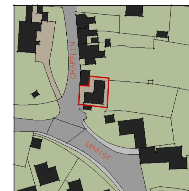
3 SITE LOCATION PLAN